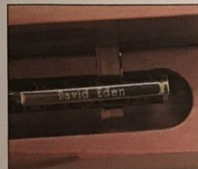
Pens & Gifts